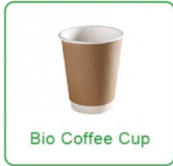
Bio Coffee Cup