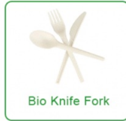
Bio Knife Fork