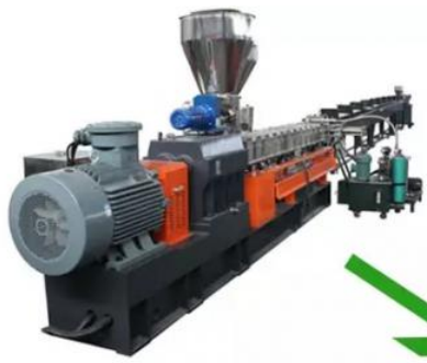
Extruder plastic machine