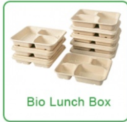
Bio Lunch Box